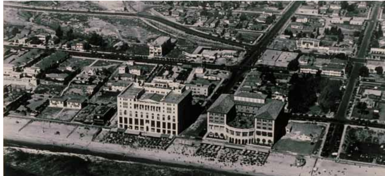
The dream of Santa Monica emerging as a major industrial port did not materialize. However, today Santa Monica continues to thrive as a world renowned visitor destination and as a center for the creative arts industry.

At the turn of the century, the City continued to be a destination for people attracted to the beach and the mild climate, and early entrepreneurs began transporting people from Los Angeles by horse and wagon. An 1895 map shows a Horse Car Line running the length of what is now Wilshire Boulevard. Later, transit lines in the form of the Pacific Electric Railway (Red Car) provided convenient access for visitors to the City, supplementing the Southern Pacific railroad. The desire for access to Santa