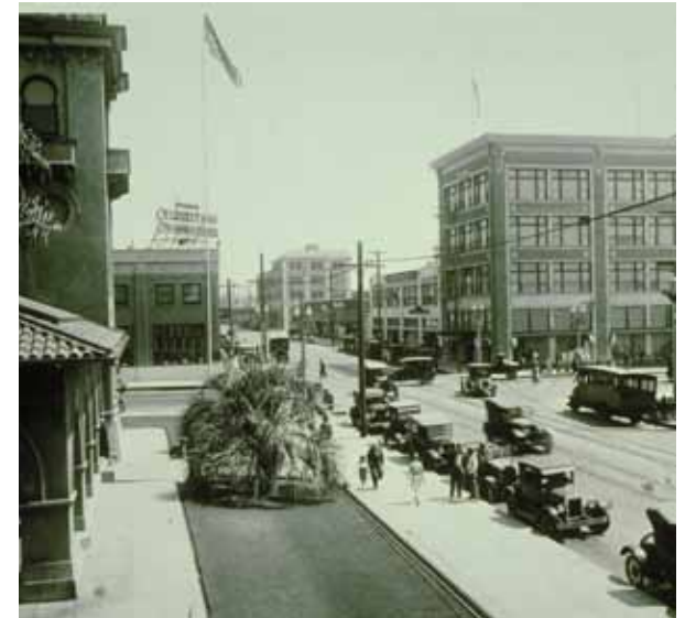
The intersection of 4th and Santa Monica Boulevard, with City Hall and commercial and bank buildings in 1926.

Adjacent to the City's primary natural resources, the Downtown appropriately includes the City's largest structures in height and mass. The regional transit services augmented by the City's own transportation system and a sophisticated public parking program support development in this most dense and pedestrian-oriented portion of the City. Within the Downtown, streets are important parts of the public realm providing both vehicular and pedestrian routes, as well as defining the historic urban block pattern. The streets provide the predominant Downtown open space and direct and define views to the ocean and the mountains to the north. The Third Street Promenade, built upon a prior redevelopment effort, creates a pedestrian precinct in the heart of the Downtown. The Santa Monica Place Mall is being redeveloped and upgraded in an open format with open access between the Civic Center and Promenade. Today the Promenade is one of the nation's premier pedestrian spaces and is an important part of the Downtown's open space pattern, bringing vitality to the Downtown seven days a week over an extended period of the day. Recent market-rate and affordable housing has added to the skyline of the Downtown and brought new life and energy.