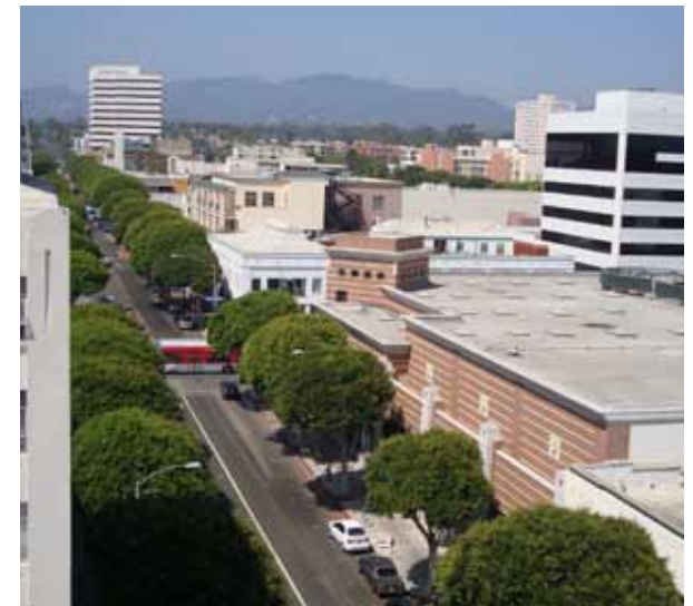
The intersection of 4th and Santa Monica Boulevard today, looking north towards the Santa Monica mountains.