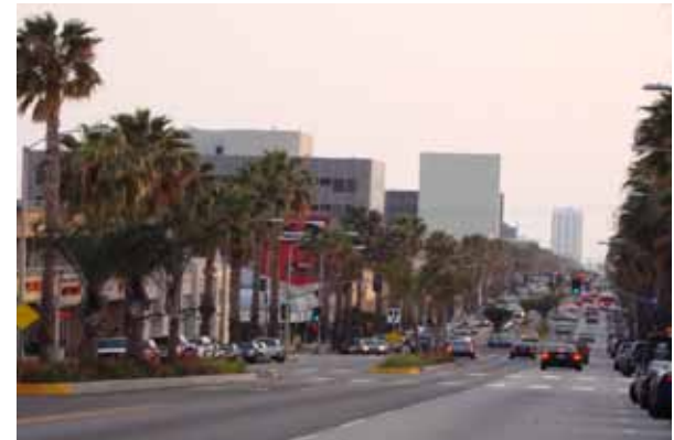
The east-west boulevards that terminate at the ocean provide the spines uniform grid around which the city has been historically organized. In contrast, the rail lines and relative isolation of the industrial lands resulted in large parcels of semi-rural land that eventually found use in the postwar industrial boom and as suburban-style office parks in the 1980s.

Distinctly different from the rest of the City, the industrial lands development pattern reflects the history of lands reserved for large-scale industrial use. The Santa Monica Airport occupies many buildings and the runways of the former McDonnell Douglas aircraft manufacturing facility. Other large industrial sites are underutilized, lie vacant, or have been converted to creative arts uses, and still