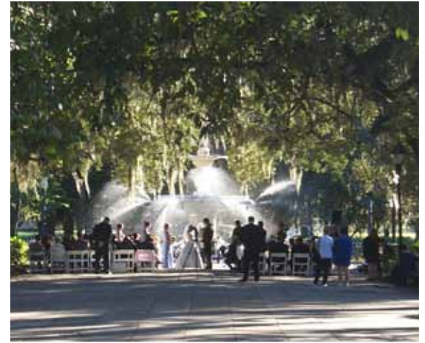
The LUCE policies plan for the increase in size and quality of the City's open space and park system.

key elements of an overall open space system. The transition of key boulevards throughout the City from commercial corridors to mixed-use pedestrian/transit streets will significantly improve the quality of these major streets as open space. The addition of residential uses provide life and activity on the streets and an enhanced pedestrian environment provides opportunities for residents to come together to dine, shop and socialize. Open space and gathering places are integral to the Plan along the City's transit boulevards, at new light rail transit-related neighborhood districts and at activity centers.