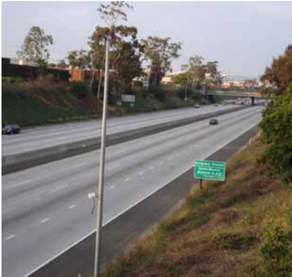
The construction of the I-10 created a permanent division between the north and south sides of the city.

provide shipping traffic for the rail; however, the shipping and rail operation proved to be unprofitable and the line was sold to Southern Pacific railroad in 1877 and the wharf removed.